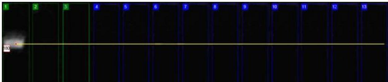
Figure 2. Electrophoregramm of DNA, which was amplyfited by «Terminator NOS» test systems.

In this electrophoresis the 3 rd path is not used. We decided to use such numbering system due to preservation of sequence of the objects, which had been showned in Table 1 . During the analysis of the received results, in one investigated product there were determined the required DNA fragments, which was corresponding to PCS. It was discovered by the test system (180 bp hadn't been revealed.).